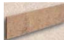
3" x 13" Bullnose