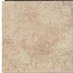
12" x 12" & 18" x 18"